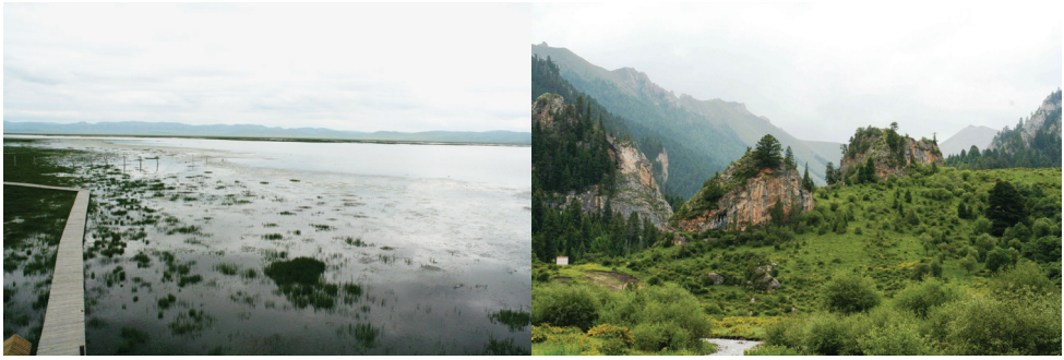
Figure 9. Protected areas—International Ramsar wetland reserve near Siblungeka, and a national reserve in the mountain region, both Gansu province 2012.