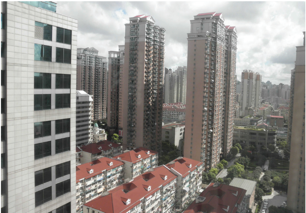
Figure 10. The trend to high rise buildings in urban construction, Shanghai 2010.

scape management not pursuing a monoculture structure without any intermittent structures providing ecological niches.