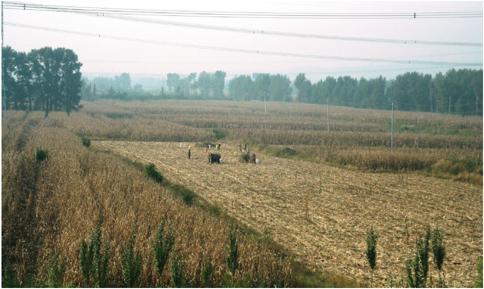
Figure 1. Agriculture on the Chinese Loess Plateau, 2013.

sation, sent water, energy and mineral consumption skyrocketing, undermined water availability and quality and turned agriculture from a net energy provider into an energy consuming industrial sector. This links the agricultural revolutions to the second major threat to ecosystem stability and sustained ecosystem service provision besides biodiversity loss, which is of course climate change (Rockström et al. 2009). Besides industrialisation and growing consumption, logging, irrigation agriculture, aquaculture and intensive animal husbandry significantly increased the emission of potent greenhouse gases like methane ( \text{CH}_4 ), laughing gas (nitrous oxide \text{N}_2\text{O} ) and carbon dioxide \text{CO}_2 .