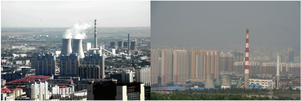
Figure 2. City power plants contribute to global warming and to local air pollution: Harbin, Heilongjiang province (left, 2010) and Taiyuan, Shanxi province (right, 2013).

Australia 39.2 Gt (7%), and Ukraine 3.9 Gt (4.6%)(end-2011 data, WEC 2013). On the other hand, coal (besides oil) is a major factor in the balance of payments and a burden for the major importers, all of them in Asia (2012: China Mainland 278 Mt and 65 Mt Taiwan, Japan 184 Mt, India 158 Mt, South Korea 126 Mt, and Germany 44 Mt)(IEA 2013). Their national economies including the consumption capabilities of consumers would benefit significantly from saving the money spent on these imports.