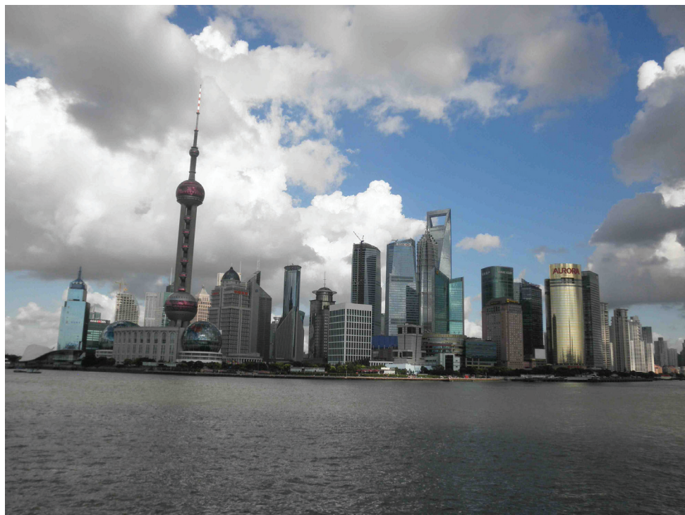
Figure 6. Growing Megacities–Shanghai/Pudong 2010.