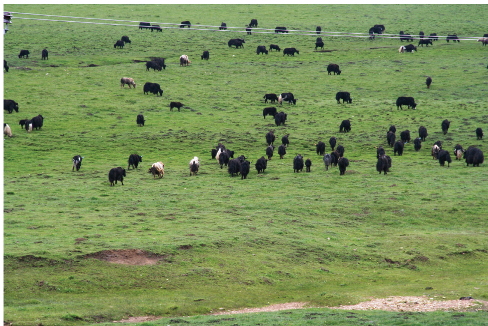
Figure 7. Intensive cattle grazing (Yaks) and first signs of erosion near Lang Mi Su, Sichuan province 2012.