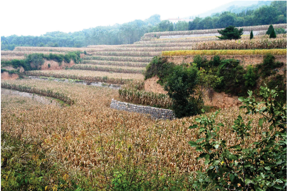
Figure 8. Agriculture in Xiyang, Shanxi province, China 2013.

use, less fertilisation reducing the attractiveness to pests, larger distances between plants resulting in higher tillerage), substituting pesticide use for supporting biological control mechanisms and organic for chemical fertiliser (Gurr et al. 2012). Such fields are less prone to plant hopper infestations than conventionally managed fields, which pose a serious threat to food security in particular in Southern China—ecological engineering is enhancing food security and by reducing soil and water pollution also food safety (Gurr et al. 2012). The system of rice intensification SRI technique has some commonalities with ecological engineering (except for the biocontrol), and reduces water demand by keeping soils wet but not necessarily flooded throughout the growing season (Noltze et al. 2013). This could be a significant contribution to relaxing China's water stress.