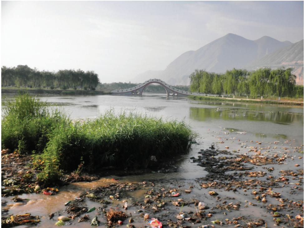
Figure 5. Water pollution in Gansu province 2012.

The widespread loss of wetlands contributed to the loss of 27,000 rivers in China (excluding Taiwan, as in most statistics), nearly half of all those estimated to exist in the 1990s, as detected in the water census published by Chinese authorities on March 26 th , 2013. Climate, although likely an important factor (this three year study coincided with a multi-year drought in central and southern China, where dramatic drops in lake levels and a shrinking Yangtze River have been well-documented), experts agree that the problem is largely man-made. Besides land use change, over-exploiting ground water for industry and agriculture, and destruction forests causing a rain shortage in the mountain areas for agricultural purposes have been named as reasons (Yan 2013).