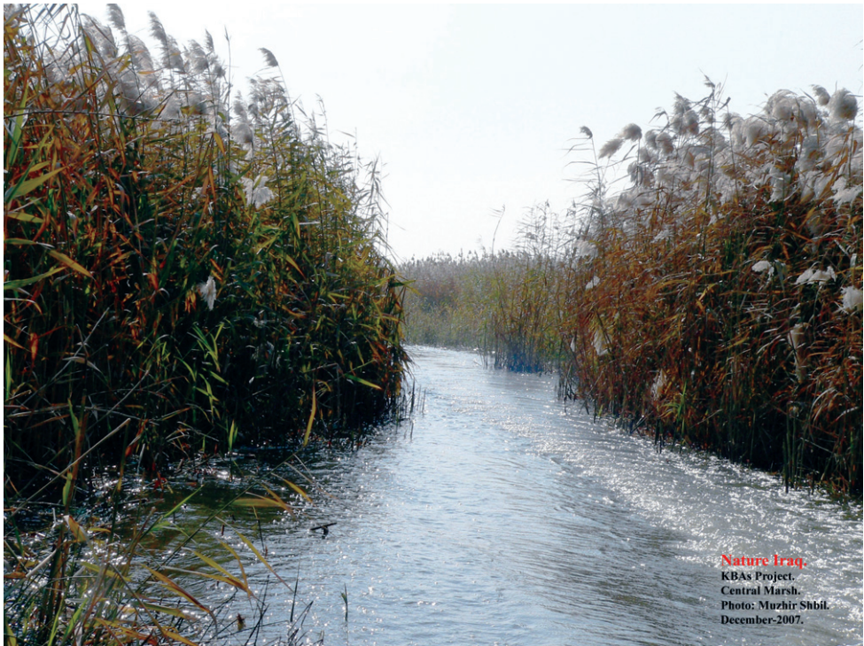
Figure 2. Central Marshes (CM), December 2007.