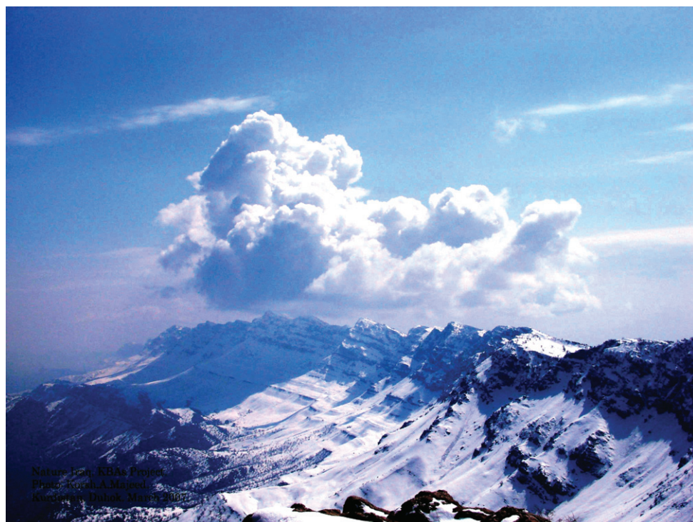
Figure 5. Gara Mountain, March 2007, Dohuk – D.

Urgent priority sites that require ongoing action at a less intensive level (30–39 points); or High priority sites that require lower-level actions (20–29 points).