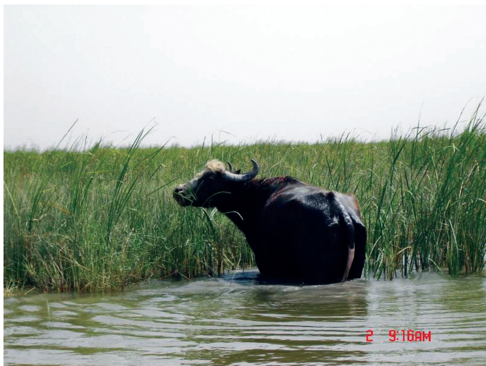
Figure 3. Hammar Marshes (HA), December 2007.