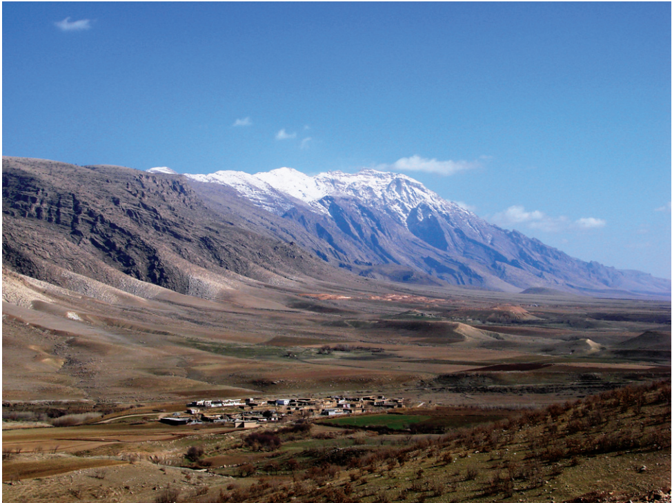
Figure 4. Peramagroon Mountain, January 2008, Sulaimani – S.